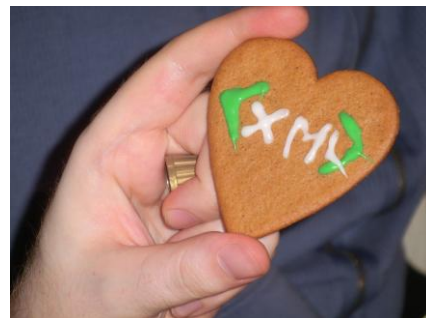
EDDI participants showed their creativity in these festive holiday cookies.

pending requests for agency IDs during 2011 have been fulfilled. The registered agencies should all be discoverable using the search on the registry site.